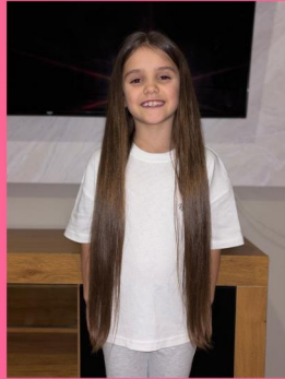
Willows hair will be cut on September 13 th 2026