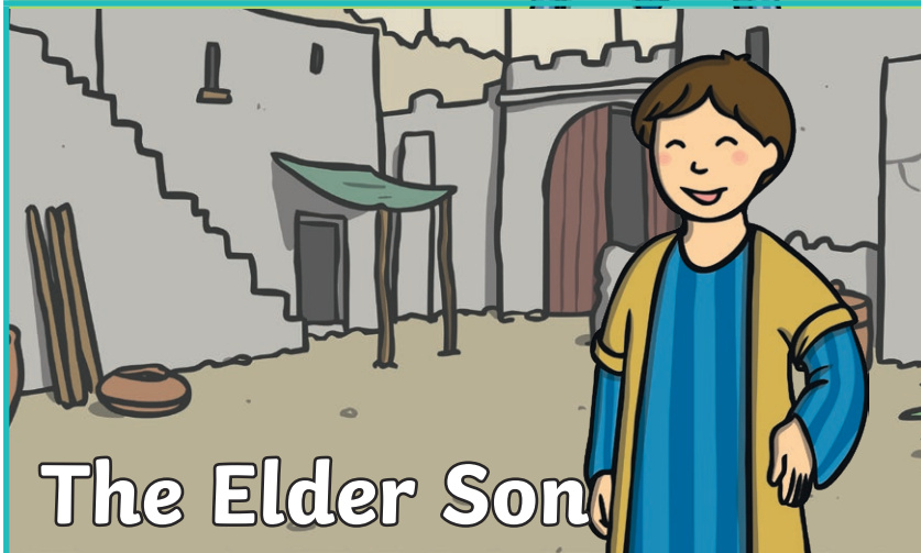
The Elder Son

Place glue here and stick under title page.