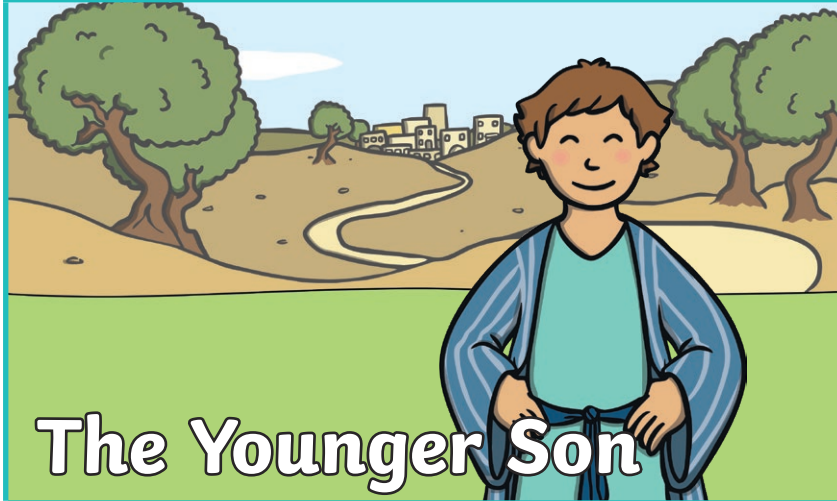
The Younger Son